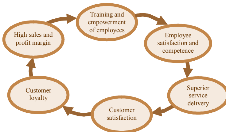
Figure 2 Virtuous circle [7]

Any loyalty program requires also special training program for employees before program starts. Training has to learn employees how to inform customers about program rules and how to operate terminals (scanners). This costs can vary significantly depending on the time and number of trainings, but employees' training cannot be passed over, if loyalty program is to be successful. In the cycle of success [6], an investment in employees' ability to provide proper service to customers can be seen as a virtuous circle (Fig.2).