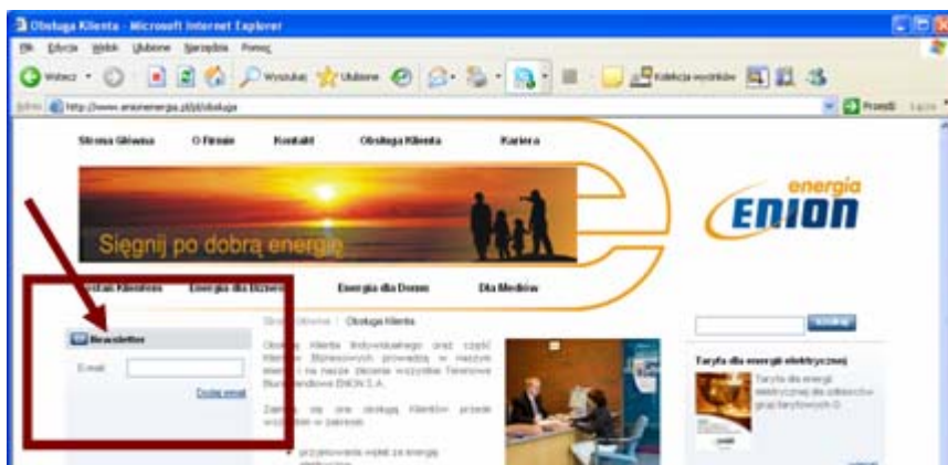
Figure 3 Newsletter order box on Enion Energia web site [8]

E-mail addresses a company can collect automatically with a help of questionnaire that is placed on www. Newsletter is not the same as spam. Spam is focused on promotion, newsletter is focused on information and built better (longer) relation with customer.