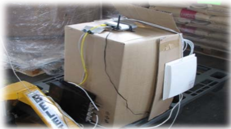
Fig. 5. RFID system configuration with the access point

By repetitive measurements in various altitudes it was recognized that the best results were achieved when antenna was 0,7m above the floor. Overall results of measurements are shown in Fig. 6.