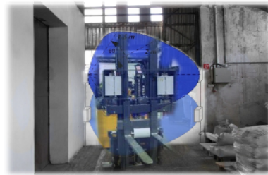
Fig. 3. Interrogation zone of antennas