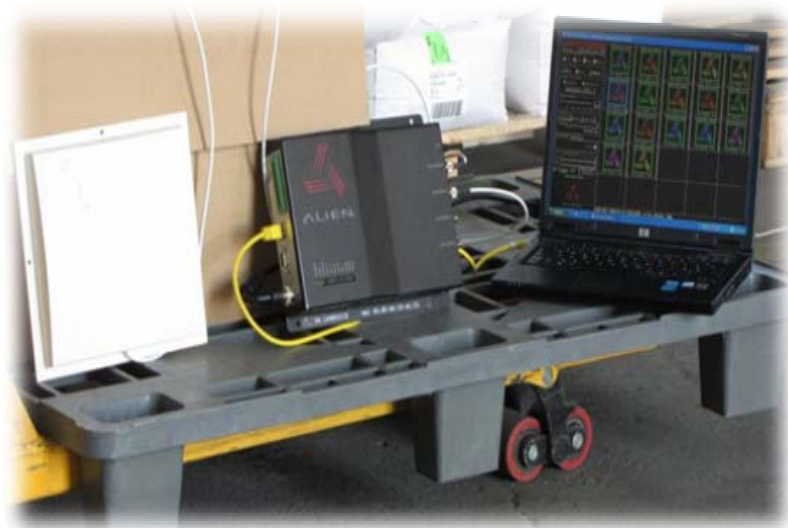
Fig. 4. RFID technology system configuration