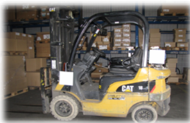
Fig. 2. Fork lift with antennas